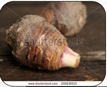
Colocasia: Seed rate-25-30q/ha Spacing-60x90cm