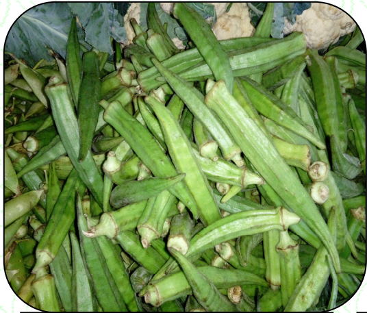
Okra: Seed rate-8-10kg/ha Spacing-45x30cm