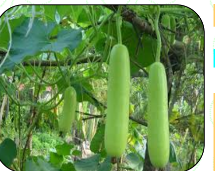
Bottle gourd: Seed rate-3-4kg/ha, Spacing-3x1m