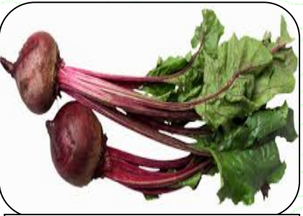
Beet root: Seed rate-7-8kg/ha Spacing-45x10cm