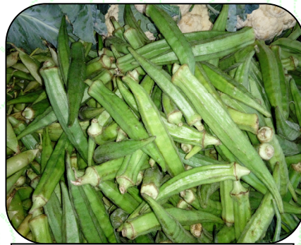
Okra: Seed rate-18-22kg/ha Spacing-60x30 cm