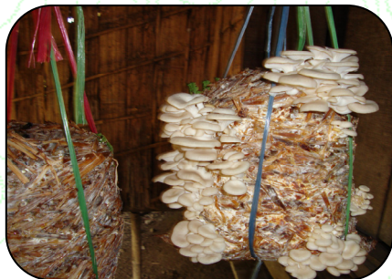
Oyster mushroom: Seed rate-100gm/Polythene bag