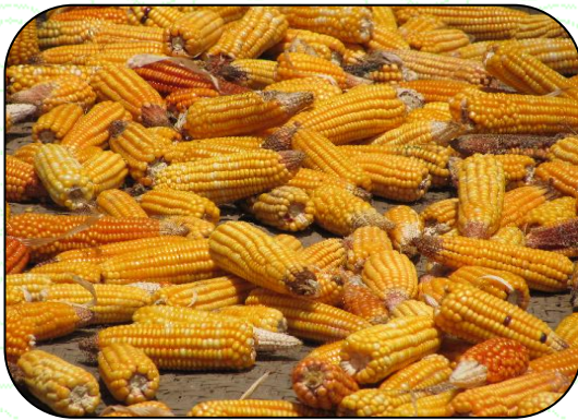
Maize: Seed rate-20-22.5kg/ha Spacing-65-75(row)x20-25(plant)