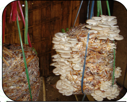
Oyster mushroom: Seed rate -100gm/polythene bag