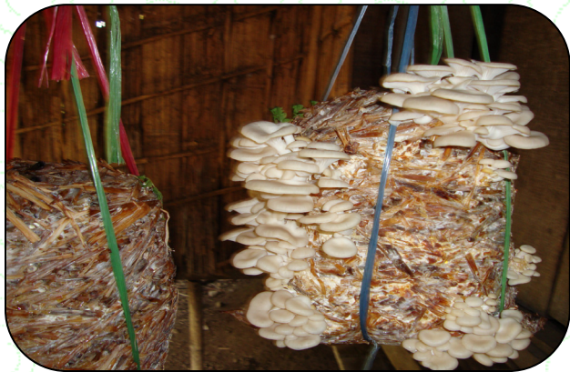
Oyster Mushroom: Seed rate- 100gm/polythene bag