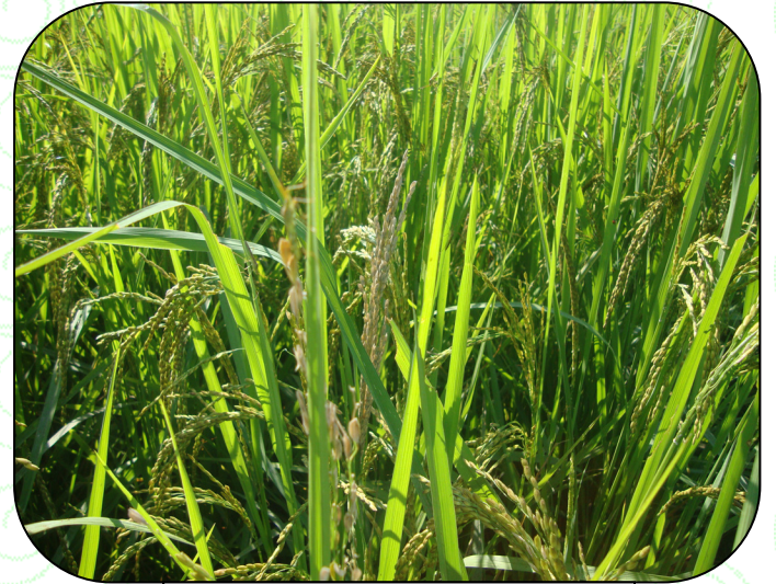
Rice: Seed rate-42kg/ha Spacing-15x30cm