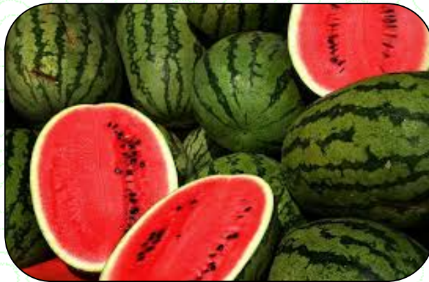
Water melon: Seed rate-3.5-5 kg/ha, Spacing-2.5-3.5m(row) x 60-90cm (hill)