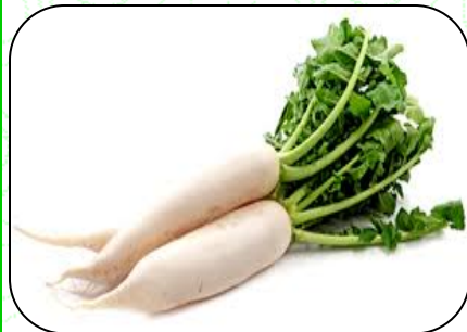
Raddish: Seed rate-9-12kg/ha Spacing-45x10cm