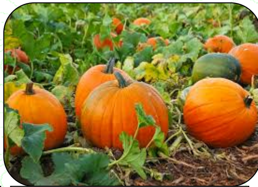
Pumpkin: Seed rate-5-6kga/ha Spacing-2.5x2m