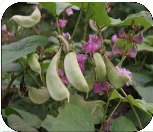
Lab Lab bean: Seed rate-10-12kg/ha Spacing-1x2m