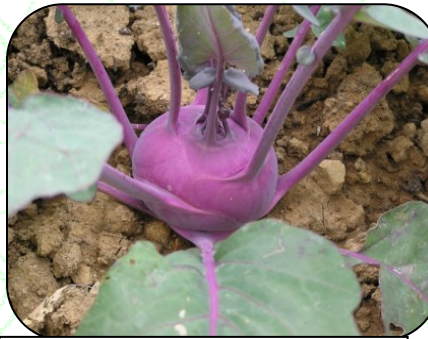
Raddish: Seed rate-9-12kg/ha Spacing-45x10cm