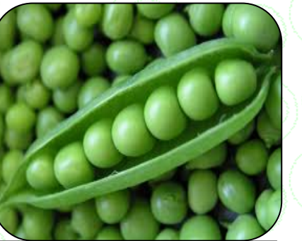
Pea: Seed rate-100-120kg/ha 80-90kg/ha, Spacing-50x10cm