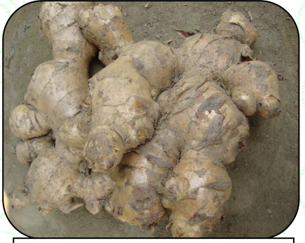
Ginger: Seed rate-20q/ha Spacing-20x50cm