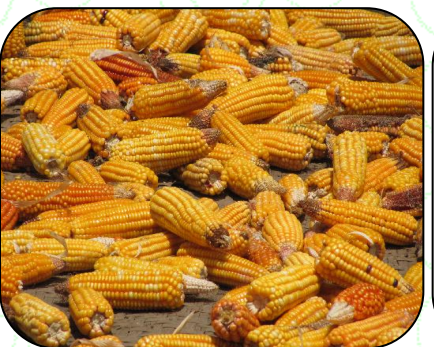
Maize: Seed rate-20-22.5kg/ha Spacing-65-75(row)x20-25(plant)