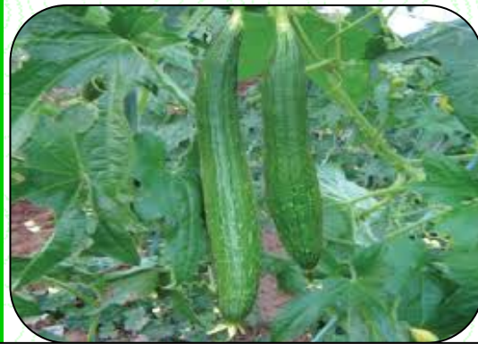
Sponge gourd: Seed rate-2.5-3.5kg/ha Spacing-1.5-2.5mx60-120cm