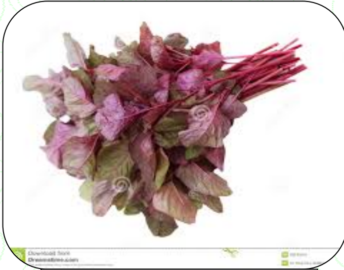
Amaranthus: Seed rate-1.5-2kg/ha Spacing-