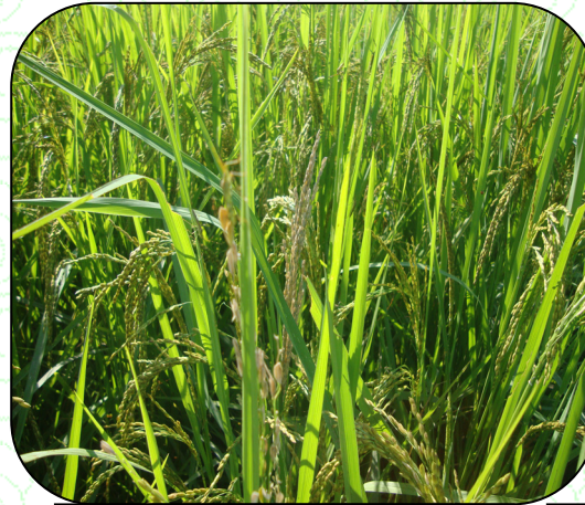
Rice: Seed rate-42kg/ha Spacing-15x30cm