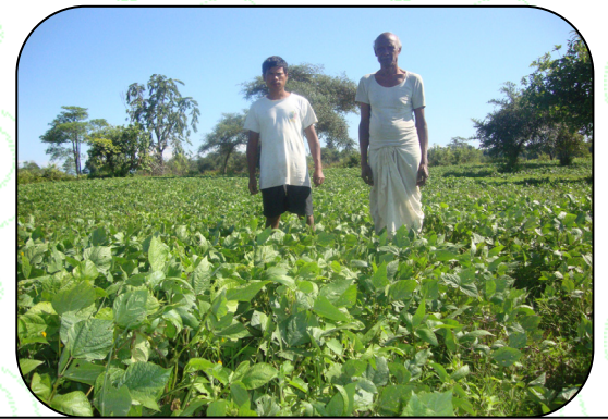
Black gram: Seed rate-20-25kg/ha Spacing-30-35cm(row to row)