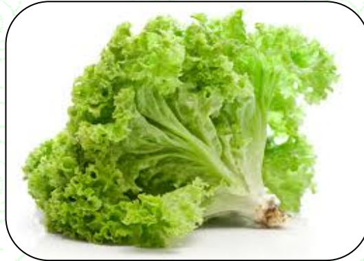
Lettuce: Seed rate-400-500gm/ha Spacing-30-45x20.25cm