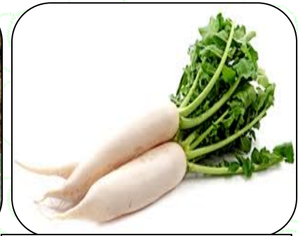
Turnip: Seed rate-3-4kg/ha Spacing-45x10cm