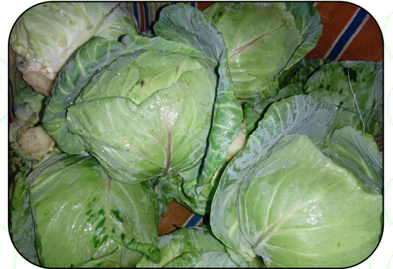
Cabbage: Seed rate-375-500gm Spacing-45x45cm, 60x45cm