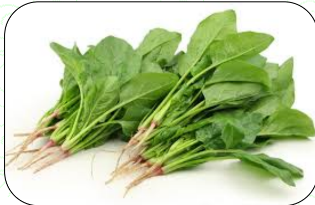
Spinach: Seed rate-10-15kg/ha Spacing-line sowing 20 cm