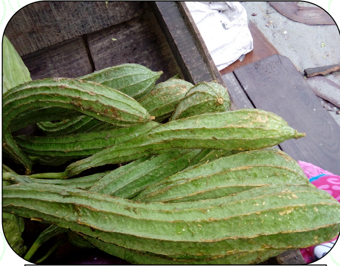
Ridge gourd: Seed rate-3.5-5kg/ha Spacing-1.5-2.5mx60-120cm