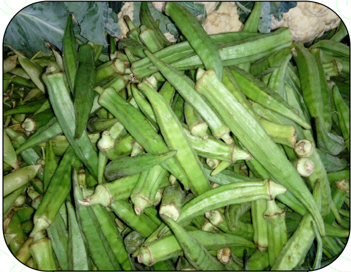
Okra: Seed rate-8-10kg/ha Spacing-45x30cm