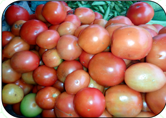
Tomato: Seed rate-150-175gm/ha Spacing-60x45cm, 75x60cm