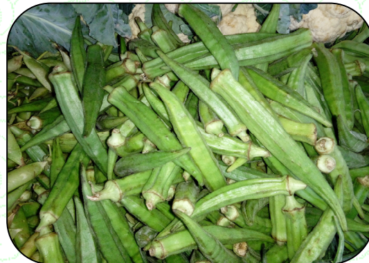
Okra: Seed rate-18-22kg/ha Spacing-60x30 cm