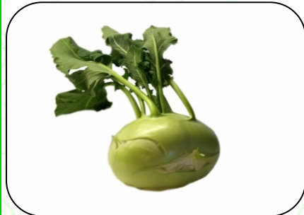
Knol khol: Seed rate-1-1.5kg/ha Spacing-30x25cm

Lohit, Namsai District, Momong, Arunachal Pradesh under-ICAR-NRC on Yak, Dirang, W.Kameng Distt., Arunachal Pradesh www.kvklohit.org , email: pckvklohit@gmail.com