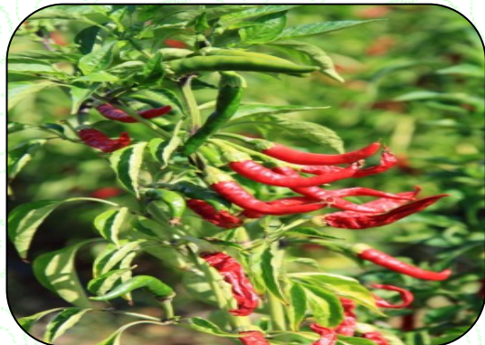
Chilli: Seed rate-1.5-2kg/ha Spacing-45x45cm, 60x30cm