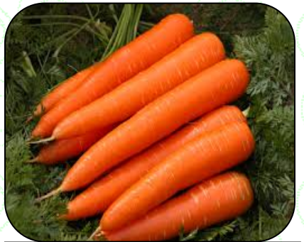
Carrot: Seed rate-5-6kg/ha Spacing-45x10cm