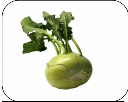
Knol khol: Seed rate-1-1.5kg/ha, Spacing-30x25cm