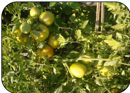
Tomato: Seed rate-150-175gm/ha Spacing-60x45cm, 75x60cm