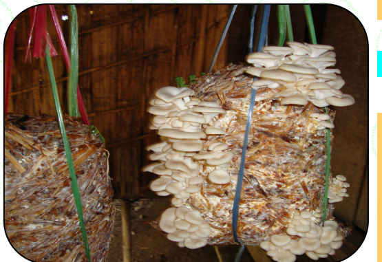
Oyster mushroom: Seed rate- 100gm/polythene bag