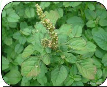
Amaranthus: Seed rate 1.5-2kg/ha, Spacing-45x20cm