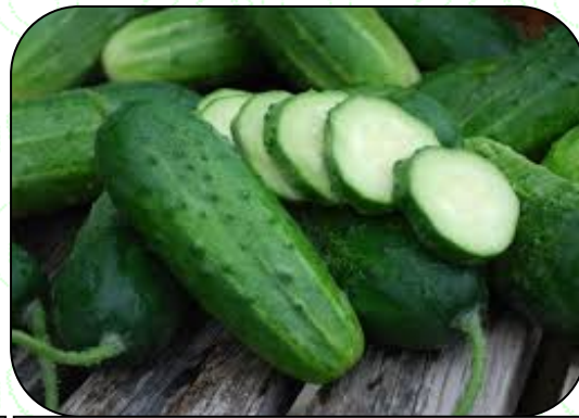
Cucumber: Seed rate-2.5-3.5kg/ha Spacing-1.5-2.5(row) x 90-120cm(hill)