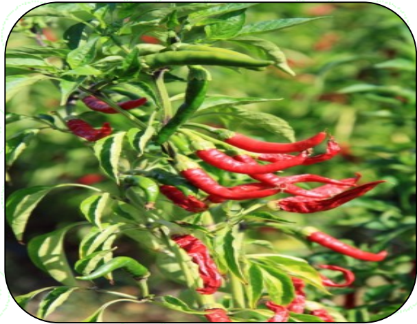
Chilli: Seed rate-1.5-2kg/ha Spacing-45x45cm, 60x30cm