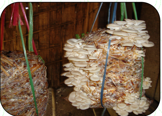
Oyster mushroom: Seed rate-100gm/polythene bag