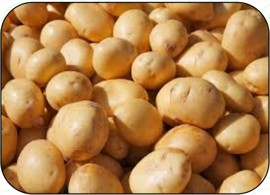
Potato: Seed rate-20-35q/ha Spacing-30-45x10cm