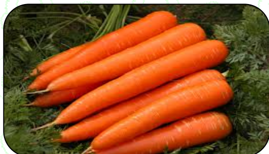
Carrot: Seed rate-5-6kg/ha Spacing-45x10cm