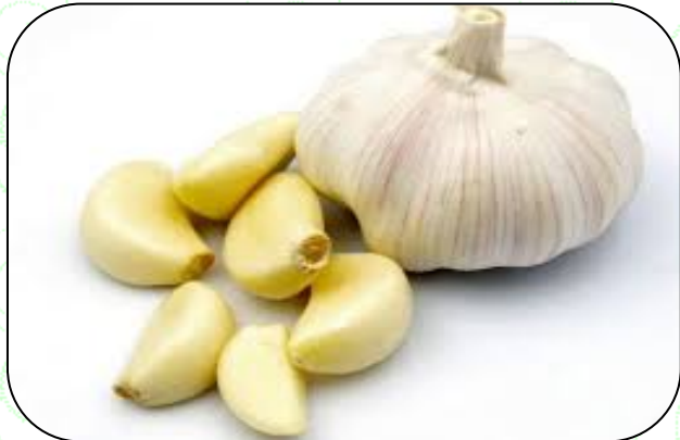
Garlic: Seed rate-500kg/ha Spacing-10x10cm, 10x8.5cm