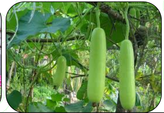
Bottle gourd: Seed rate-3-4kg/ha Spacing-3x1m