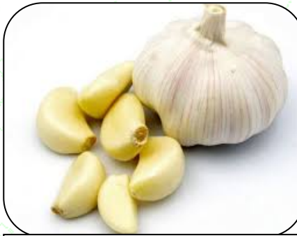
Garlic: Seed rate-500kg/ha Spacing-10x10cm, 10x8.5cm