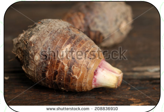
Colocasia: Seed rate-25-30q/ha Spacing-60x90cm