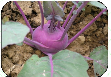
Turnip: Seed rate-3-4kg/ha Spacing-45x10cm