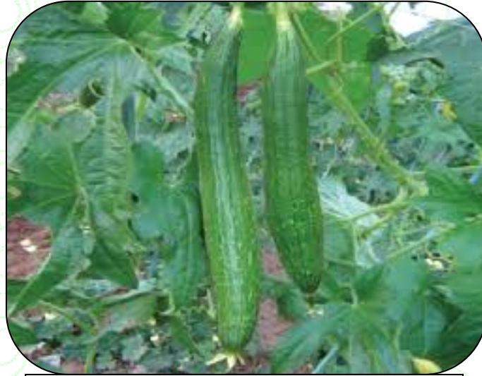
Sponge gourd: Seed rate-2.5-3.5kg/ha, Spacing-1.5-2.5mx60-120cm