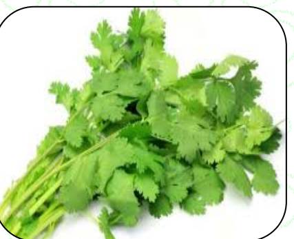
Coriander: Seed rate-25-30kg/ha (rain), Spacing-43x10cm