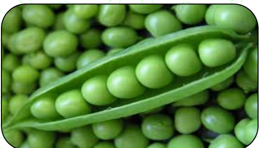
Pea: Seed rate-100-120kg/ha(early) 80-90kg/ha, Spacing-50x10cm