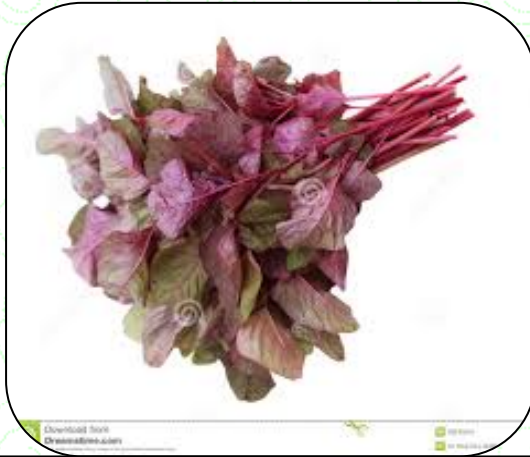
Amaranthus: Seed rate-1.5-2kg/ha Spacing-