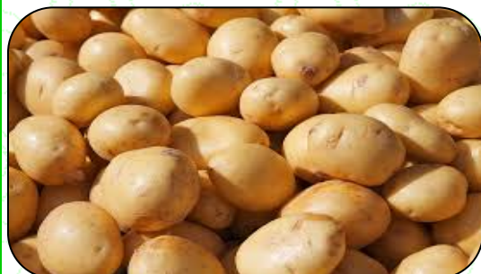
Potato: Seed rate-20-35q/ha Spacing-30-45x10cm