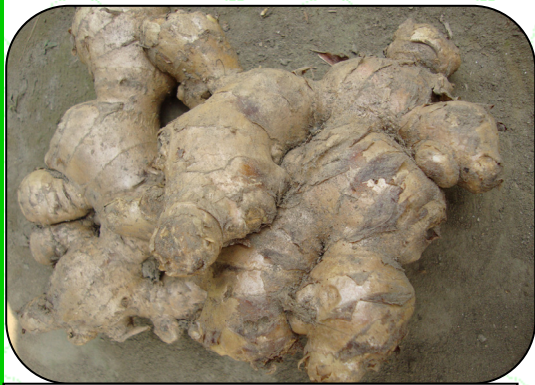
Ginger: Seed rate-20q/ha Spacing-20x50cm