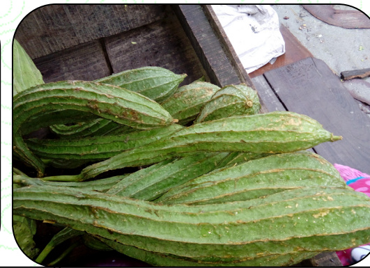
Ridge gourd: Seed rate-3.5-5kg/ha Spacing-1.5-2.5mx60-120cm