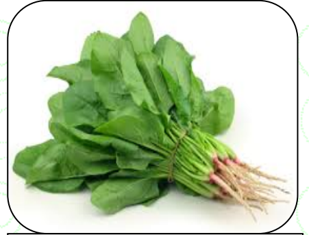
Spinach: Seed rate-10-15kg/ha Spacing-line sowing 20 cm