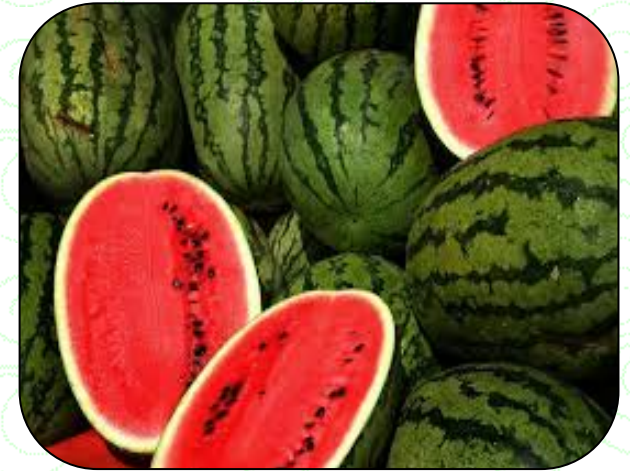
Water melon: Seed rate-3.5-5kg/ha Spacing-2.5-3.5cm (row)x 90-120cm