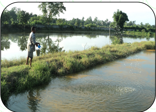
Apply CaO(lime) @ 20kg/bigha along with potassium permanganate @ 1kg/bigha (in three installment at the interval of 7 days)