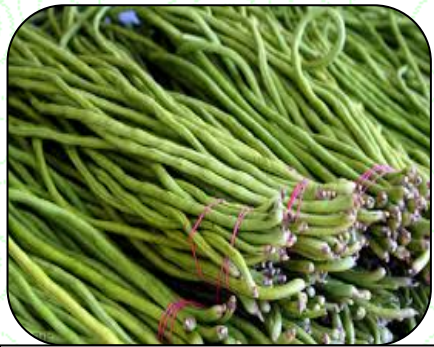
Cowpea: Seed rate-20-25kg/ha Spacing-60x50cm