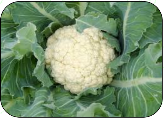
Cauliflower: Seed rate-500-600cm/ha Spacing-45x45cm, 60x45cm