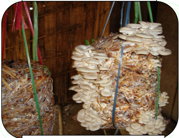
Oyster Mushroom: Seed rate-100g/ polythene bag