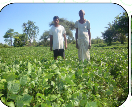
Black gram: Seed rate-20-25kg/ha, Spacing-30-35cm(row to