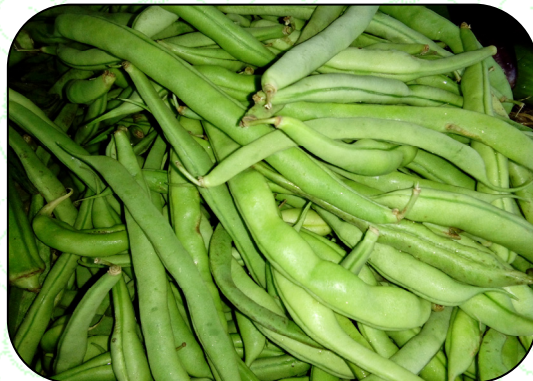
French bean: Seed rate-50-70kg/ha Spacing- 60x30cm