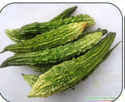
Bittergourd: Seed rate-4.5-5kg/ha, Spacing-1x1m