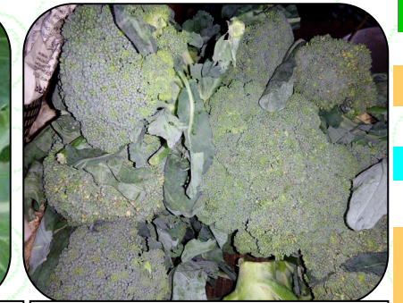
Broccoli: Seed rate-400-500gm/ha, Spacing-45x45cm