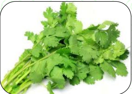
Coriander: Seed rate-25-30kg/ha (rain), Spacing-43x10cm