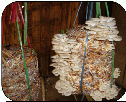
Oyster Mushroom: Seed rate-100gm/Polythene bag