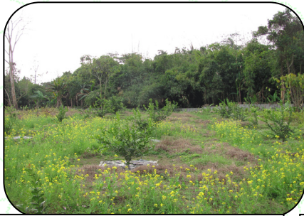
Mustard: Seed rate-10kg/ha