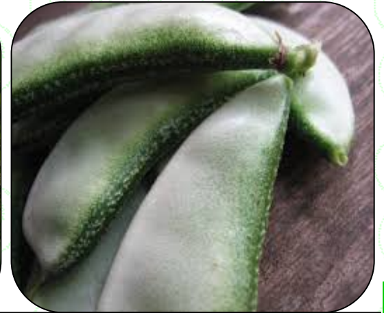
Lab Lab bean: Seed rate-10-12kg/ha Spacing-1x2m