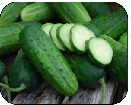
Cucumber: Seed rate-2.5-3.5kg/ha, Spacing-1.5-2.5(row) x 90-120cm