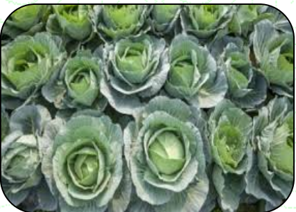
Cabbage: Seed rate-375-500gm Spacing-45x45cm, 60x45cm