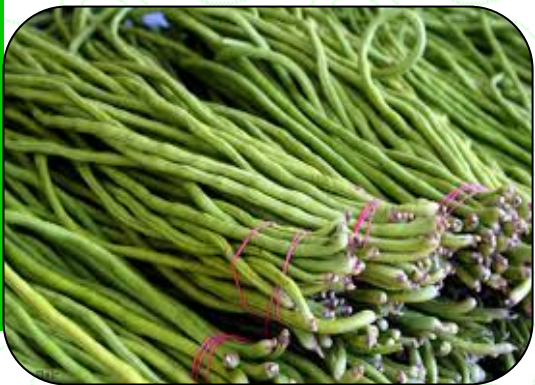
Cowpea: Seed rate-20-25kg/ha Spacing-60x50cm