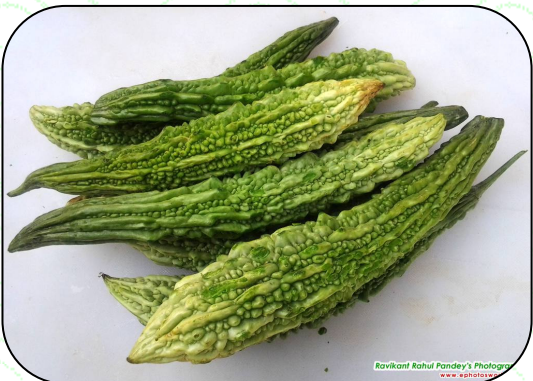
Bittergourd: Seedrate-4.5-5kg/ ha, Spacing-1x1m