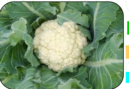
Cauliflower: Seed rate-500-600cm/ha Spacing-45x45cm