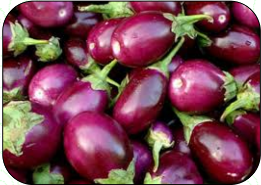
Brinjal: Seed rate-200gm/ha Spacing-60x45cm, 90x90cm