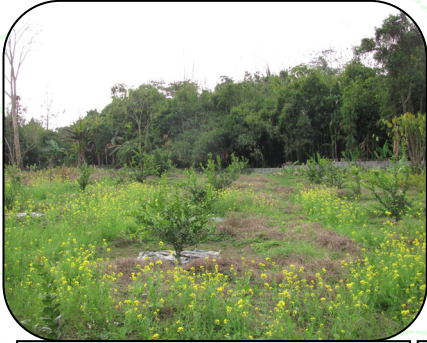
Mustard: Seed rate-10kg/ha