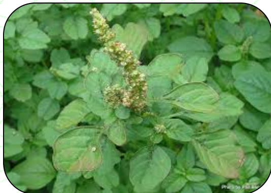
Amaranthus: Seed rate-1.5-2kg/ha Spacing-45x20cm